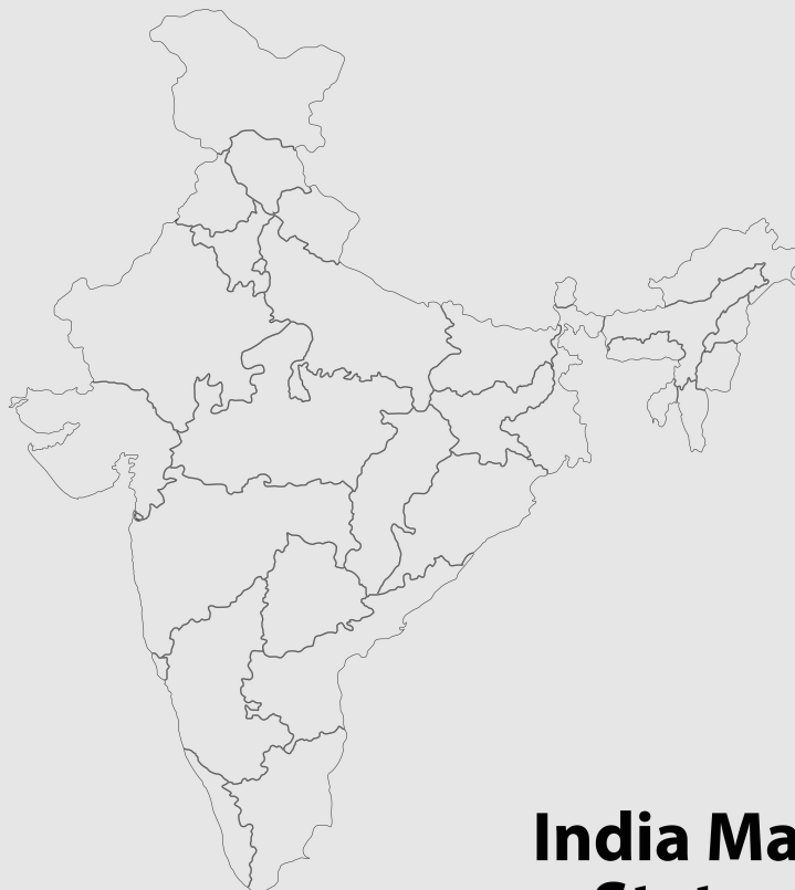
India Map States